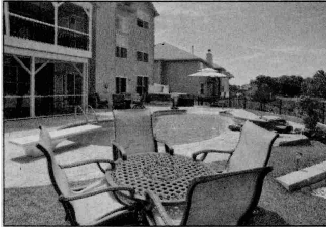
Custom and semi-custom homebuilder Rock Creek Homes can construct the ultimate outdoor entertainment paradise.

Date: Thursday, July 16, 2009 Location: GLENVIEW, IL Circulation (DMA): 8,458 (3) Type (Frequency): Newspaper (W) Page: 2 Keyword: Jeff Benach