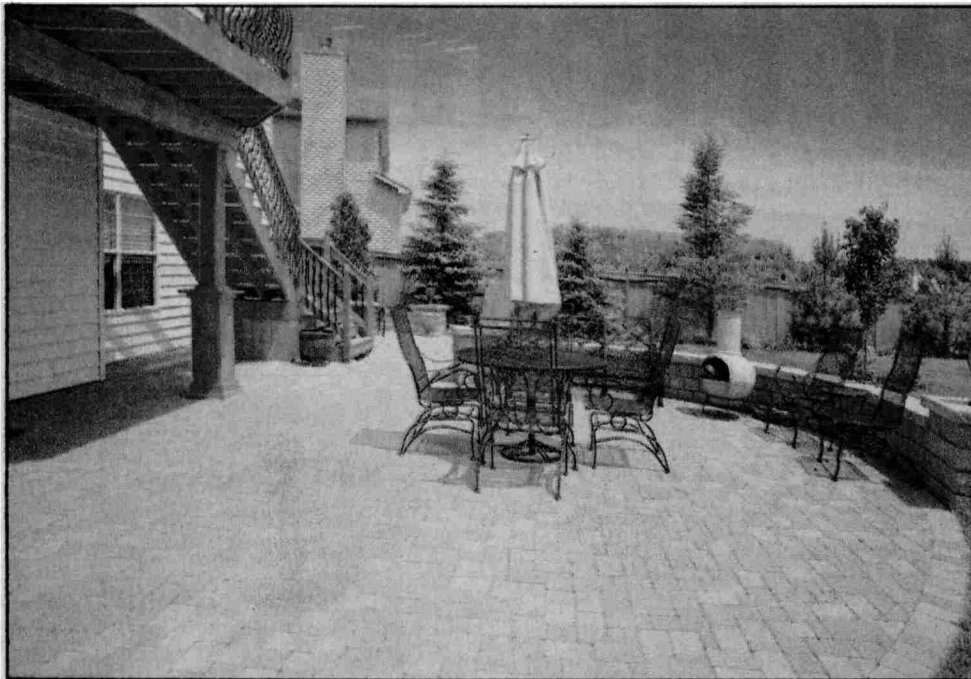
Rock Creek Homes offers stamped concrete, which is as durable as real stone, creates the same architectural appeal, is easy to maintain and costs less to install.

To learn more about Winthrop Club, call 847-328-4700 or visit www.winthropclub.com .